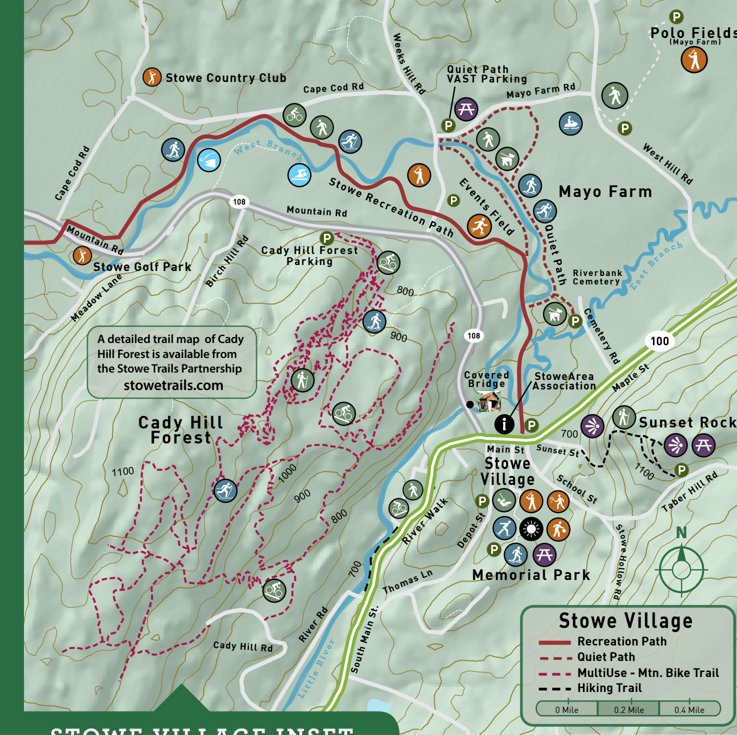
STOWE VILLAGE INSET